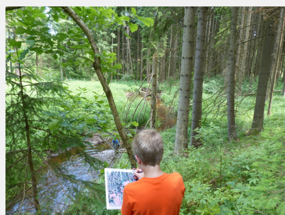
Fig. 1.: mapping morphological structures

Together with the students the research group develops, investigates and maps spatial, abiotic and biotic indicators (Fig. 1) for identifying and assessing crucial functions and processes of riverine landscapes characterized by different human uses.